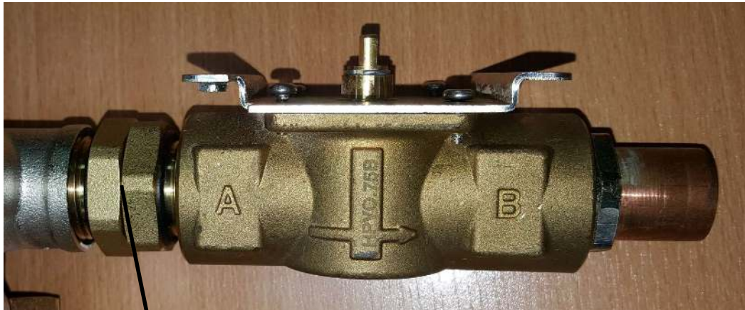
Existing valve with head removed

Reuse this fitting ( \frac{3}{4} " M x \frac{3}{4} " M BSP) PPA0169